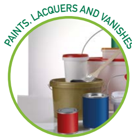
PAINTS, LACQUERS AND VANISHES