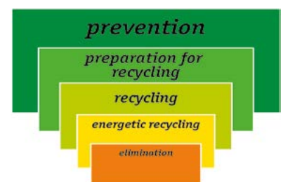
EU hierarchy of waste

The partners in the initiative of the Ministry of the Environment, Climate and Biodiversity, which has been running successfully since 1992, are the Luxembourg chambers of trade and commerce. The services of SuperDrecksKëscht® fir Betriber (for site operators) offer important help to them as they implement Luxembourg's country-wide plans for waste management and sustainable development, both of which aim to create an environmentally sound and energy/resource-efficient economy. This means climate protection practiced.