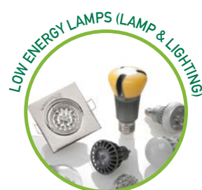
LOW ENERGY LAMPS (LAMP & LIGHTING)