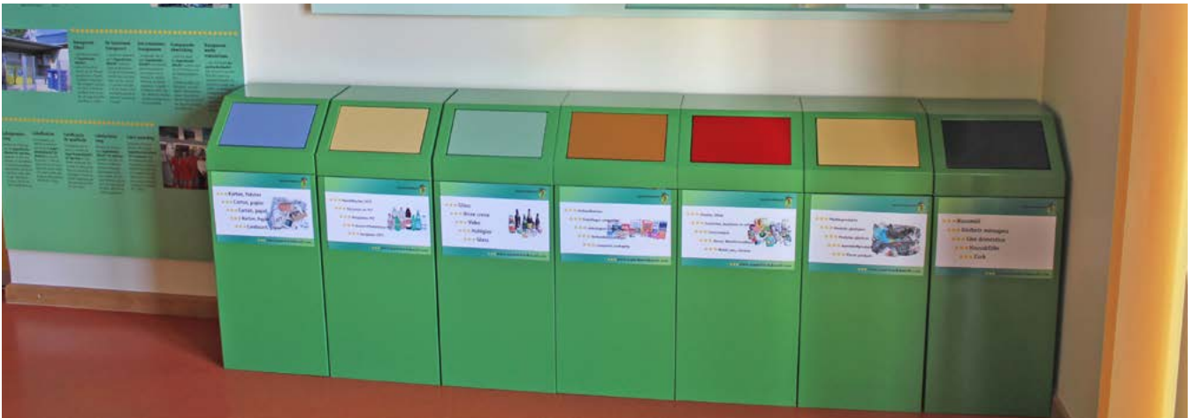
Separate collection of materials and the avoidance of wastage - the two go together

Dealing with waste places high demands on the producers of the material concerned. Current national legislation covering waste management, which dates from 6th June 2022, and the national zero waste strategy explicitly makes commercial organisations responsible for observing the EU hierarchy of waste. Prevention and reuse are the top priorities in waste management. Next comes material recycling for the circular economy, before any other processing (e.g. energy recovery) or final disposal. Not only is intelligent waste management environmentally-friendly and sustainable, it also helps to save money and therefore boosts competitiveness.