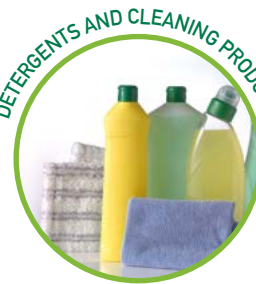
DETERGENTS AND CLEANING PRODUCTS