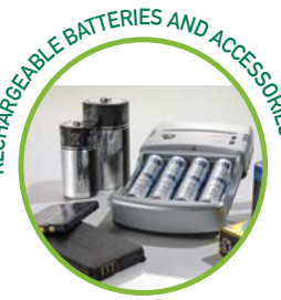
RECHARGEABLE BATTERIES AND ACCESSORIES