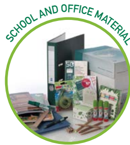
SCHOOL AND OFFICE MATERIAL