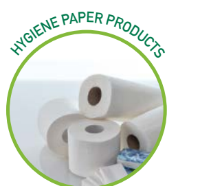
HYGIENE PAPER PRODUCTS