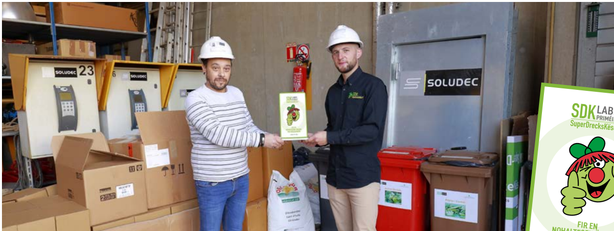
Official hand over of the label for sustainable handling of resources

SuperDrecksKëscht® fir Betriber (for site operators) bears the seal of quality for environmentally sustainable handling with resources. This is awarded by the Luxembourg Ministry for Sustainable Development and Infrastructure, acting in conjunction with the country's chambers of trade and commerce. The label certifies conformity with the international standard ISO 14024:2018, which establishes the inspection procedures and requirements that test organisations must observe.